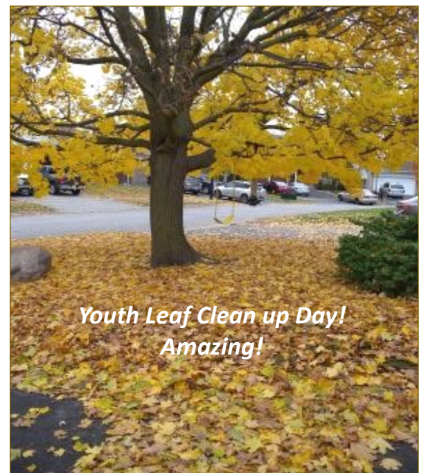
Youth Leaf Clean up Day! Amazing!