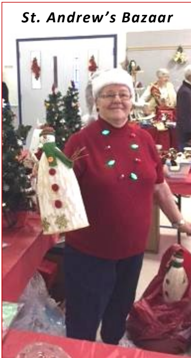
St. Andrew's Bazaar