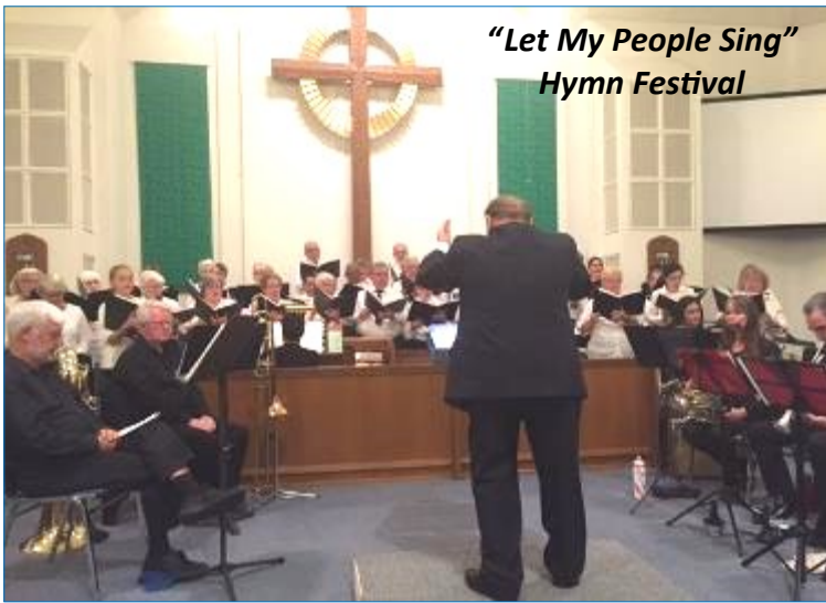
"Let My People Sing" Hymn Festival