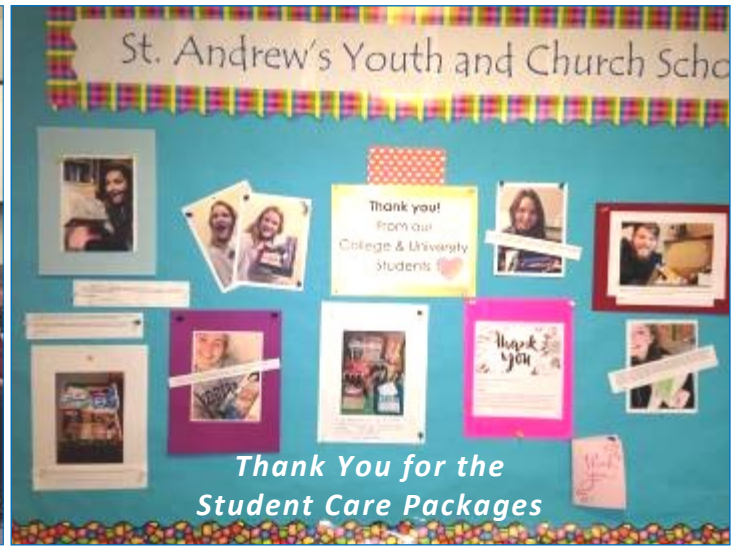
Thank You for the Student Care Packages